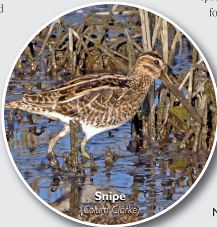
Snipe (Colum Clarke)

All pathways here link up to bring one back westwards towards the car park, again passing the old allotment area.