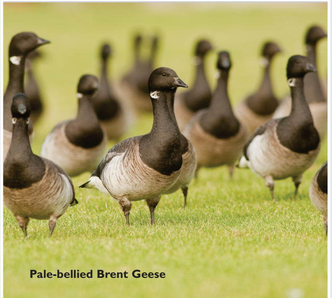
Pale-bellied Brent Geese

Note: to reach the Turvey bird hide you have to walk (or cycle) from the car park for a distance of approximately one kilometre. The Turvey Parklands area is large and if several hours are spent there it may not be possible to complete the full itinerary of Rogerstown in one day, especially in winter.